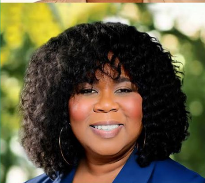
COMMISSIONER KARLENE MAXWELL-WILLIAMS CITY OF LAUDERDALE LAKES